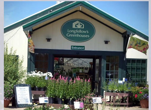
81 Puddledock Rd., Manchester

To RSVP call 623-4559 or Email info@kennebecvalleychamber.com