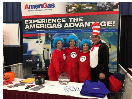
Third Place Exhibit Amerigas