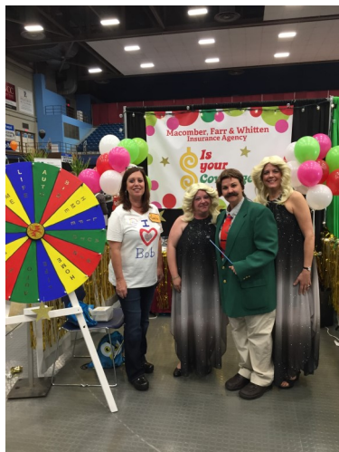
Second Place Exhibit Macomber, Farr & Whitten