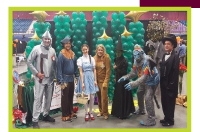
1st Place Booth: