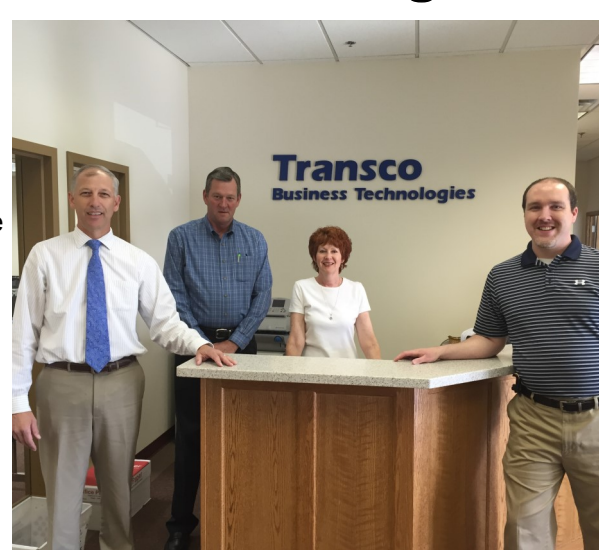
34 Leighton Road, Augusta

Look forward to the next Business After Hours at Quarry Tap Room, on December 14, 2016.