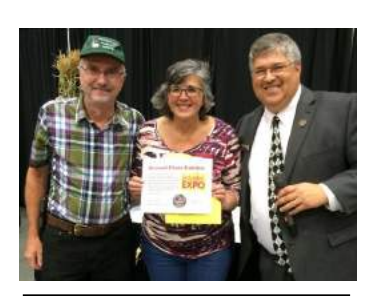
Emery's Meat & Produce