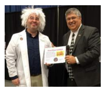
1st Place Booth University of Maine at Augusta