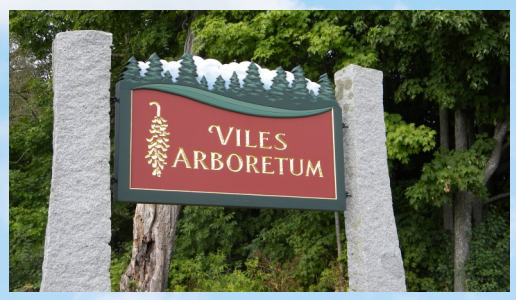
153 Hospital Street, Augusta

Delicious hors d'oeurves will be served and beer, wine, and refreshments will be available. Complimentary wine will be available courtesy of Cellardoor Winery.