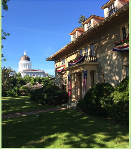
184 State Street, Augusta

To RSVP call 623-4559 or Email info@kennebecvalleychamber.com